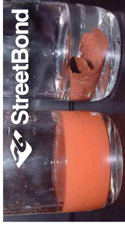
Fuel emulsion tests comparing regular polymer coating with StreetBond150. StreetBond is resistant to damage from fuel, oil, salts and de-icing agent exposure.

StreetBond coatings retain the environmental and ease-of-use advantages of being water-based while incorporating proprietary performance enhancing epoxy cross-link technology that makes them best-in-class for durability. Independent third party engineering evaluation of StreetBond150 and competing asphalt coatings technologies shows that StreetBond150 is your choice if performance is your goal.